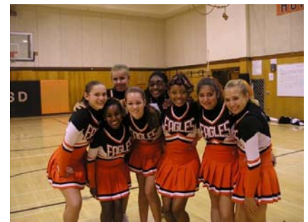
California School for the Deaf Fremont Cheerleading Team